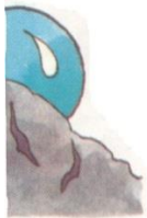
High surface tension

DUSTSET 2020 Concentrate is a highly effective wetting solution capable of reducing water surface tension by more than 80% at ratios of up to 1:4000