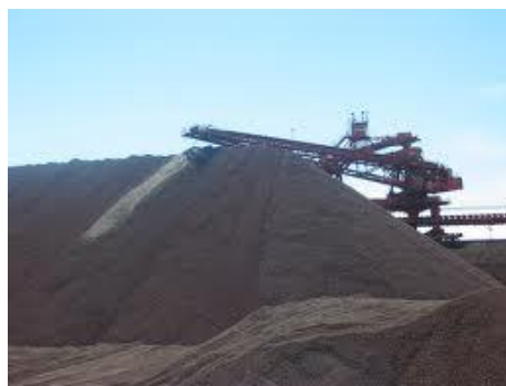
Stockpile dust control