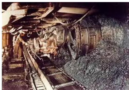
Underground dust suppression